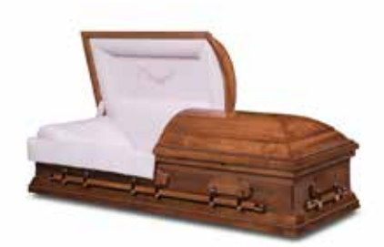
Madison $2,995 Maple Gloss-Finish Veneer Moss Pink Fabric Interior