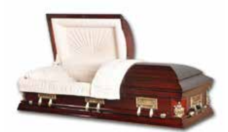
Lincoln $2,995 Poplar Gloss-Finish Veneer Cashmere Velvet Interior