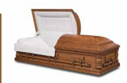
Buchanan $3,495 Oak Satin-Finish Veneer Champagne Velvet Interior