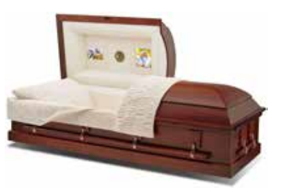
Taft $2,995 Cherry Satin-Finish Veneer Rosetan Crepe 27" Interior*