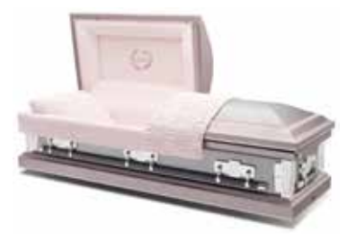
Silver Rose $2,195 Painted 20 Gauge Steel Light Pink Crepe Interior