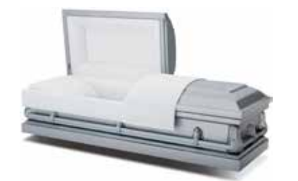
Silvertone $1,495 Painted 20 Gauge Steel Ivory Crepe Interior