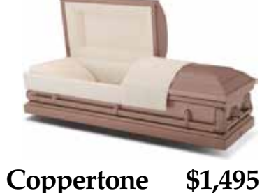
Painted 20 Gauge Steel Rosetan Crepe Interior