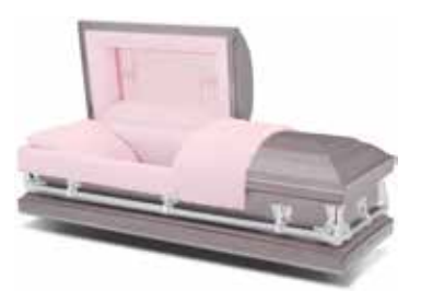
Orchid Mist $1,995 Painted 20 Gauge Steel Light Pink Crepe Interior