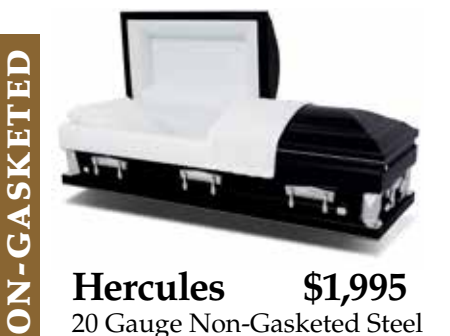
Hercules $1,995 20 Gauge Non-Gasketed Steel Ivory Crepe 28" Interior