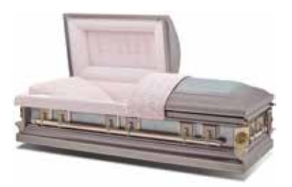
Athenian $5,995 Brushed Stainless Steel Moss Pink Velvet Interior