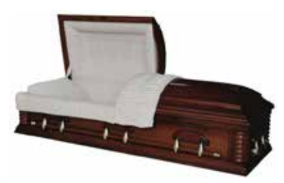
Washington $3,995 Polished Cherry Veneer Cashmere Velvet Interior