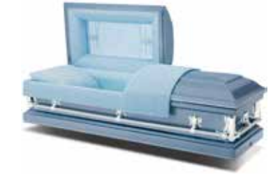
Sky Blue $1,995 Painted 20 Gauge Steel Light Blue Crepe Interior