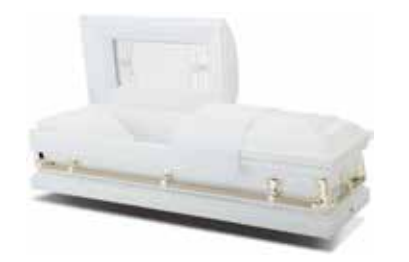
Ivory Gold $1,995 Painted 20 Gauge Steel Ivory Crepe Interior