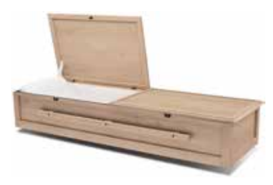
Taylor $1,495 Pine-Finish Wood Composite Ivory Crepe Interior