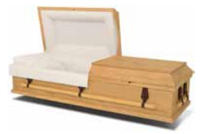
Carter $1,995 Natural Satin-Finish Veneer Rosetan Crepe Interior