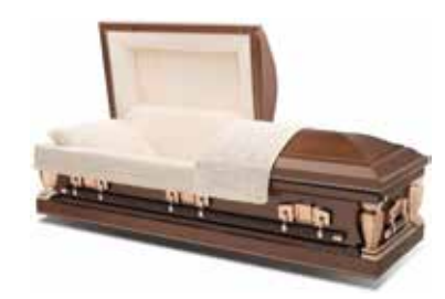
Harvest $2,495 Painted 18 Gauge Steel Rosetan Crepe Interior