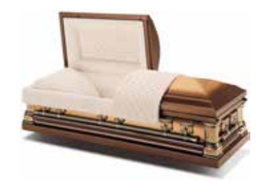
Aegean $9,995 Brushed 32 Oz. Copper Champagne Velvet Interior