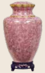
Hong Kong Pink $300