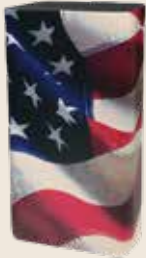
Natural Scattering $100