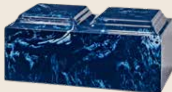
American Blue $350 Dual-Capacity