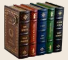
Book Set $150