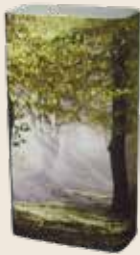
Natural Scattering $100