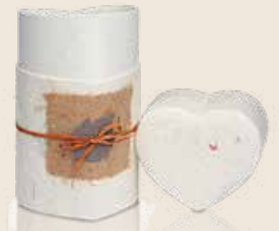
Blooming Heart $150