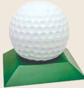
Golf Ball $200