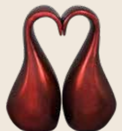
Amore $500 Two-Piece Companion