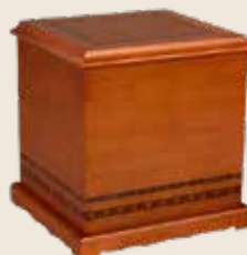
Alexander $300 Dual-Capacity